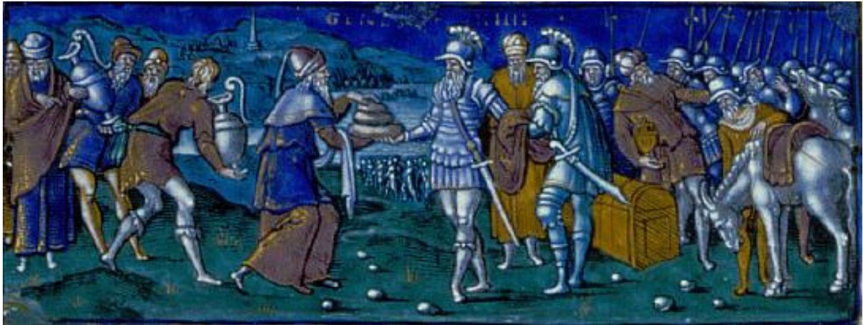
Abram Being Presented with Bread and Wine by Melchizedek School of Pierre Courteys, 1580. Public domain .